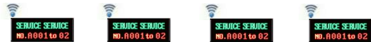
MINI AFFICHAGE LED COMPTEUR SANS FIL