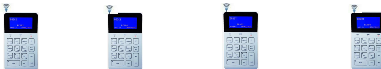
CLAVIER SANS FIL